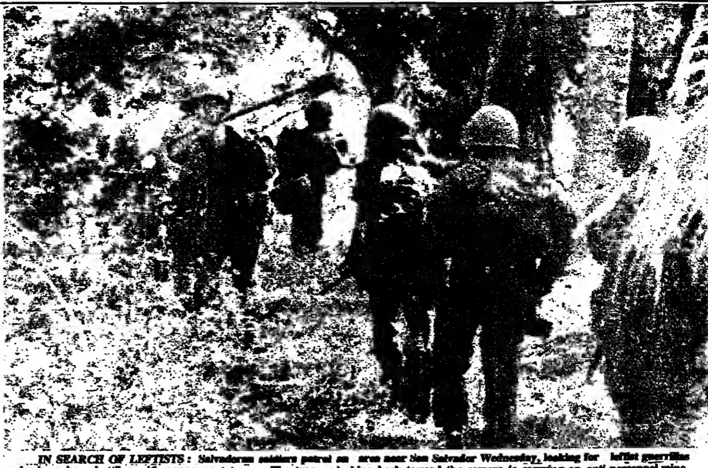
IN SEARCH OF LEFTISTS: Salvadoran soldiers patrol an area near San Salvador Wednesday, looking for leftist guerrillas who have been battling with government troops. The trooper looking back toward the camera is carrying an anti-personnel mine.

RPG-2-type rocket-propelled grenade. The RPG-2 is of Chinese manufacture. On Tuesday unidentified attackers blew a hole in a wall outside the Nicaraguan Embassy but no injuries were reported there either. The leftist guerrilla group Popular Liberation Forces later claimed responsibility for the attack in telephone calls to local radio stations. The FPL is one of several leftist guerrilla groups fighting to topple the U.S.-backed civilian-military junta. An embassy statement said the grenade smashed through a window, exploded in the vacant fourth-floor office and sent fragments through a door. The office of charge of affairs Frank Chapin, highest ranking U.S. diplomat in El Salvador, is on the fourth floor but the embassy will not disclose its location for security reasons. It was not immediately clear if Chapin was in the embassy. In other developments, forces of the U.S.-backed Salvadoran junta battled leftist guerrillas in the northeastern region of Morazan, a government spokesman said Wednesday. Morazan, a guerrilla stronghold about 100 miles from the capital, has been the scene of some of the heavier fighting recently in the struggle for power here.